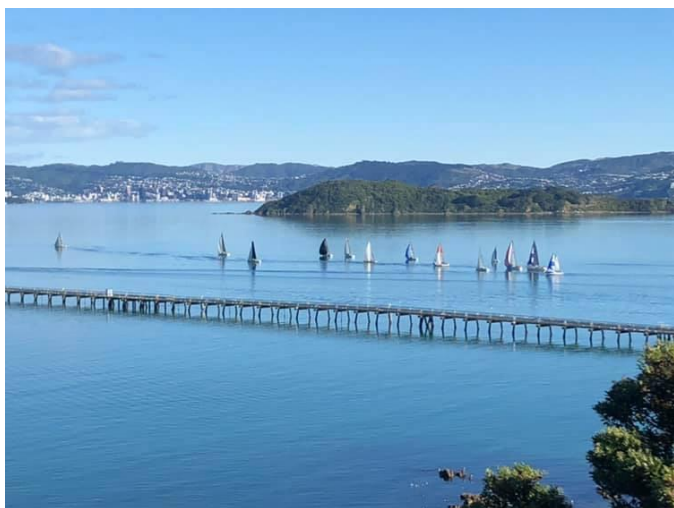
Long Harbour race start

First True Blue Second White Heat Third Celebrity