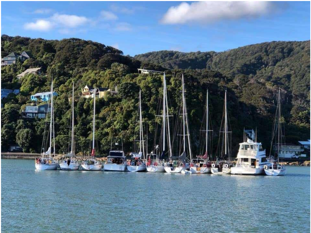
11 Boats, over 30 people. Awesome!

Queen's Birthday raft-up – Our cool little club is in good heart!