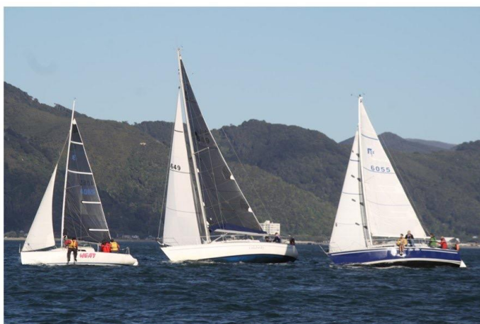
White Heat, Celebrity and True Blue